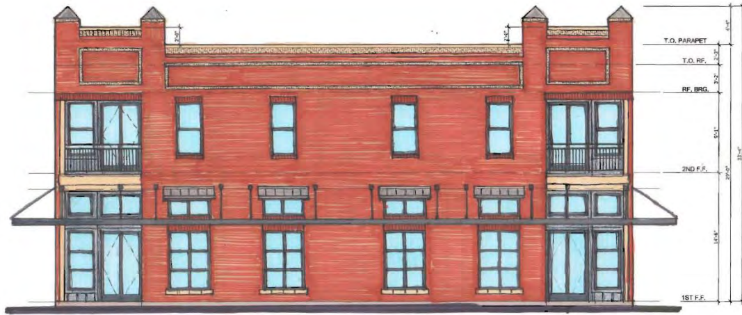
① FRONT ELEVATION (SOUTH) 8/3/2021 1/8"=1'-0" LADC 619 MAIN ST, LAVON

Construction of this 6,000 square foot two story, mixed use development is expected in the 2 nd quarter of 2022 with a project value of around $3,000,000.