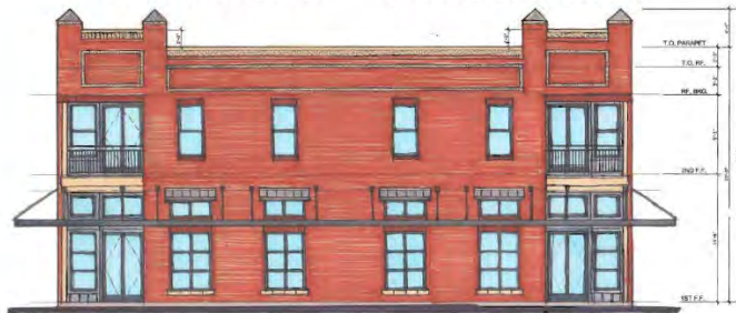
① FRONT ELEVATION (SOUTH) 8/21/2021 1/8"=1'-0" LEDC 619 MAIN ST., LAVON